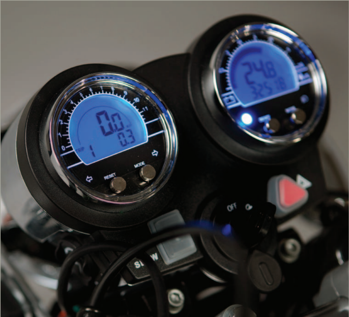
TWIN DIAL DIGITAL DASH & TRIP COMPUTER WITH ODOMETER