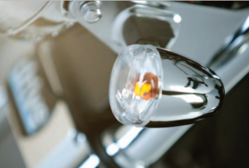
ALL ROUND LIGHTING INCLUDING A LARGE HEADLIGHT, FRONT & REAR INDICATORS AND REAR BRAKE LIGHTS