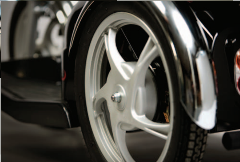
MOTORCYCLE STYLE WHEELS WITH CHROME MUD GUARDS