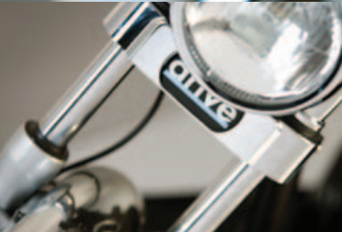
TELESCOPIC FRONT MOTORCYCLE SUSPENSION FOR OPTIMAL HANDLING